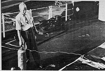
Le gaz insufflé dans les navires, pour détruire insectes et rats, contenu dans des bombannes, se nomme "methyl Bromide". Lorsqu'un navire est désaffecté le ministère de la Santé lui octroie un permis de séjour de six mois.

Un fléau commun à la plupart des grandes villes du monde est celui des rats. La ville de Montréal n'est pas exempte de ce grave problème, et certains experts en la matière avancent même que la population de ces petits rongeurs est probablement le double de celle des humains.