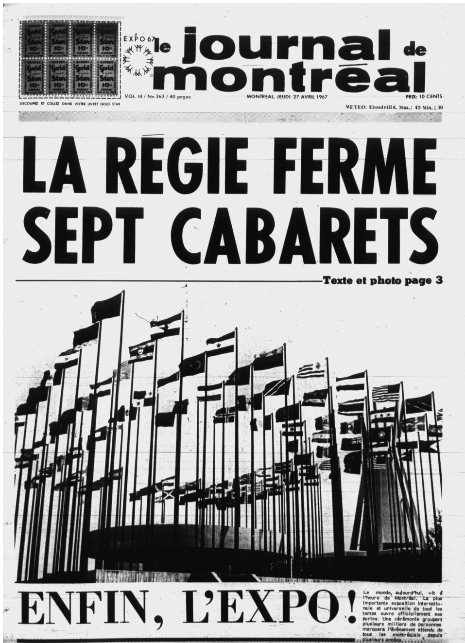
14.1 'Enfin, L'Expo!' Cover of Le Journal de Montréal , 27 April 1967.