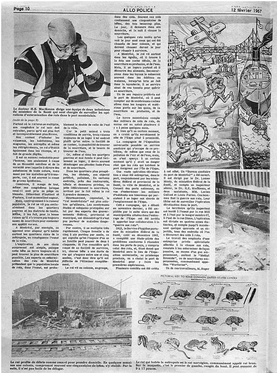
14.2 The tabloid Allo Police used a range of graphic forms in its coverage of a possible rat invasion of the Expo site. Image from Allo Police , 12 February 1967.