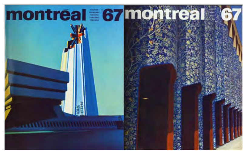
Figure 2 : Two issues of Montreal 67 (February and April).

participate in what I see as one of the key discursive operations of Montreal magazine and other Montreal periodicals of the 1960s. This operation is that of reinterpreting what it means for Montreal to be French. "Showcase for Canada's Haute Couture" (September 1964), for example, ties Montreal's new sartorial sophistication to an emergent culture of travel and to a trans-Atlantic traffic in influences and personnel: "Credit for this [the liveliness of Montreal's fashion scene] is due to the Paris training of a number of its designers; the physical growth of Montreal since the Second World War; a more demanding taste stemming from travel, and the arrival of large numbers of Europeans and the pioneering efforts of the Association of Canadian Couturiers" (Meehan 13).