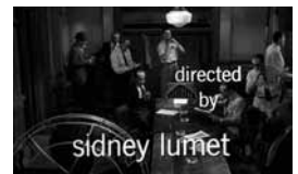
Figure 12 Still from the credit sequence of 12 Angry Men (dir. Sidney Lumet, 1957).