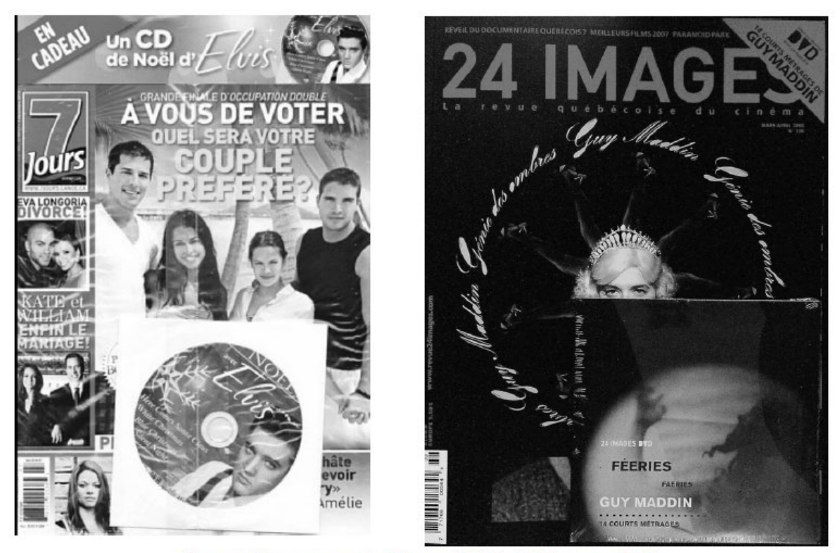
Figure 1. Couvertures de 7 Jours (2010) et 24 Images (2008). Captures d'écran des sites Internet des magazines.

For a structurally similar example of media hosting, we might consider, as well, those magazines for computer enthusiasts which, in the 1990s and early 2000s, offered CD-ROM discs full of computer programs attached to their front covers by what was often an artisanal use of adhesive tape or glue. While, on the one hand, the content of these discs (typically open source computer programs or trial versions of software offered as an enticement to eventual purchase) was of little value relative to the expert knowledge contained within the magazines themselves, the status of the CD-ROM as an emergent technology allowed the magazine hosting it to convey the sense of itself as a multi-media object. Across a range of magazines published at the beginning of this century, covers came to be re-organized so as to offer a frame for the appended digital disc and surround it with text touting its value.