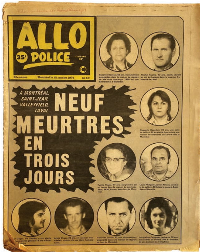
9.1 Allô Police , 12 January 1975. Cover.

those victims who were themselves involved in criminal activity), the restriction of all of these images to headshots and the forward orientation of almost all the faces renders most of them official in character, even when they might have been cropped from family snapshots or other forms of vernacular photography. As a result, these portraits of victims are indistinguishable, in most cases, from the photographs of criminals appearing elsewhere in the paper.