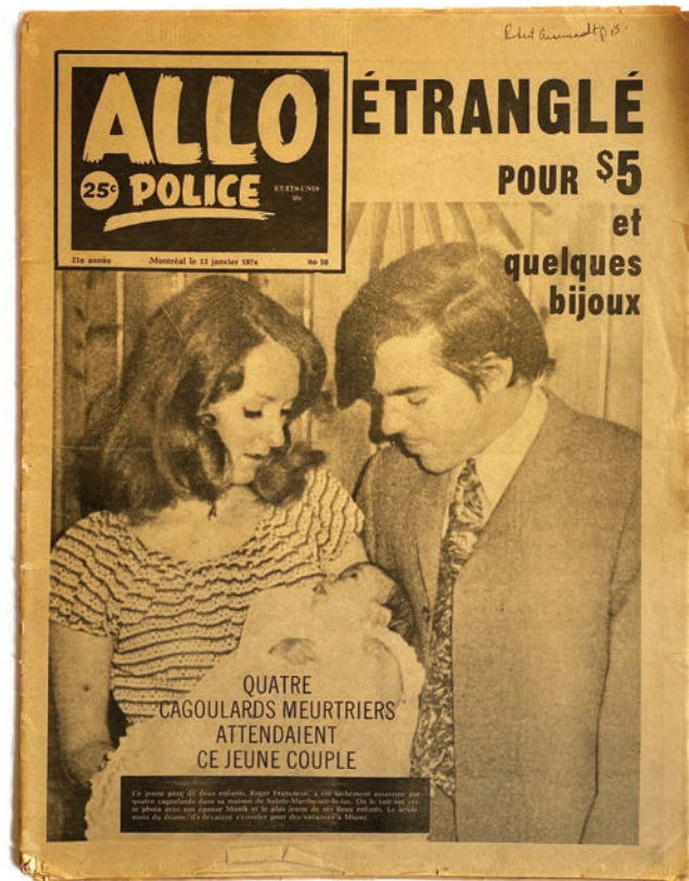
9.2 Allô Police , 13 January 1974. Cover.

provide us with no clues with which to distinguish their roles. Much of the sordid character of Allô Police in the 1970s rests precisely on this generalization of the mug shot format, which gathers up and gives similar treatment to people of widely varying degrees of culpability and victimization. In these images of the human face we find, confirmed, Allan Sekula's thesis about the tensions in judicial photography between individuation and the production of statistical regularities. 16 Even as Allô Police 's reporting captured the distinct narratives of each individual's implication in a universe of criminal events, the periodical's mimicry of the poses and layouts of police photography reduced each subject to a symbol of an all-pervasive criminality.