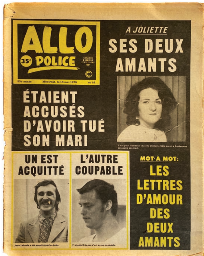
9.3 Allô Police , 18 May 1975. Cover.

of gangland executions. The innocent demeanour conveyed in photographs like that in Figure 9.2 confirms the origin of these images as family photographs, taken before the occurrence of the tragic events they are meant to illustrate. However, the difference between these images of innocence and the photographs of crime scenes or arrested suspects which appeared beside them extends beyond the temporal gap between moments before and after a crime. We are dealing, in fact, with two very different kinds of photographic heritage. The images of victims or perpetrators were taken by true crime journalists or agents of justice, who worked with the knowledge that their photographs bore a connection to criminality. In contrast, family photographs were produced within the normal routines of vernacular or professional family photography (and then borrowed or purchased by true crime periodicals). 17 The affective complexity of true crime periodicals has much to do with the fact that they contain large numbers of each of these kinds of photographs.